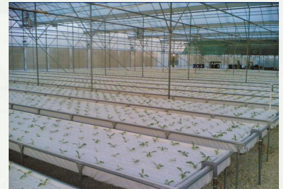
Modern irrigation hydroponic