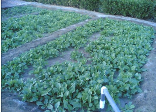
Traditional irrigation systems